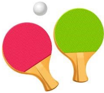
Table Tennis & Cornhole